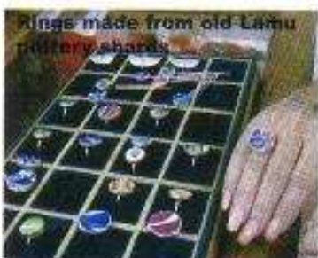
Rings made from old Lamu pottery shards