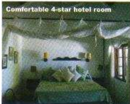
Comfortable 4-star hotel room