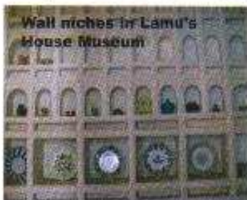
Wall niches in Lamu's House Museum