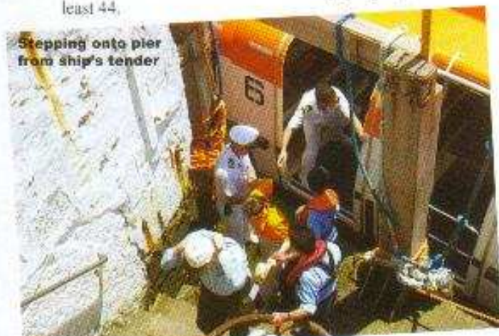
Stepping onto pier from ship's tender

From 1982 Ascension became a staging post for the British Task Force in connection with the Falklands War, and RAF Vulcan bombers were deployed at Wideawake Airfield. Not only were the jets which fired the opening shots of the Falklands War launched from Ascension, but Wideawake became the world's busiest airfield for