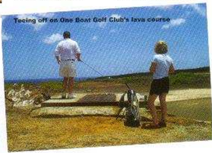
Teeing off on One Boat Golf Club's lava course