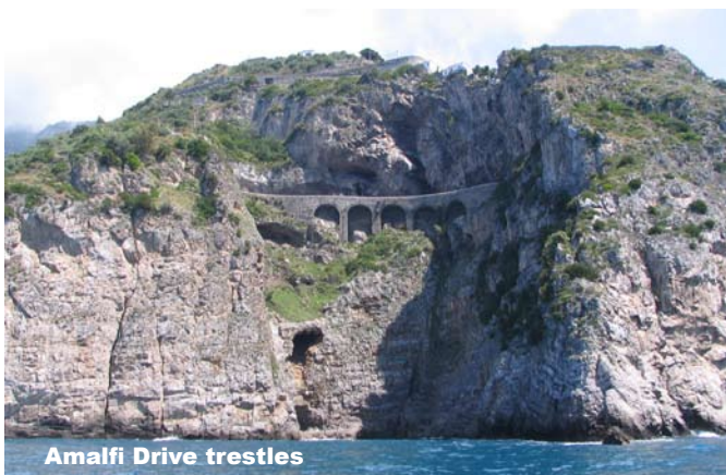
Amalfi Drive trestles

in the west and Salerno in the east. In summer there are also ferry and hydrofoil services between Amalfi, Positano and Capri and between Amalfi, Positano and Naples.