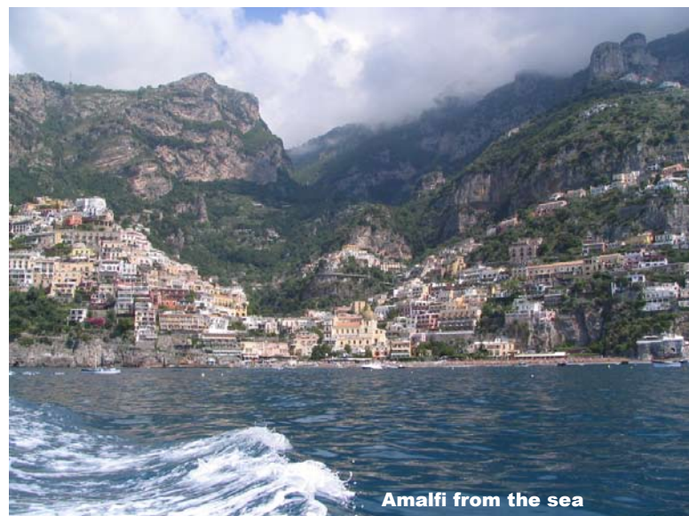
Amalfi from the sea

cliffs and a rocky coastline broken occasionally by coves with sandy beaches.