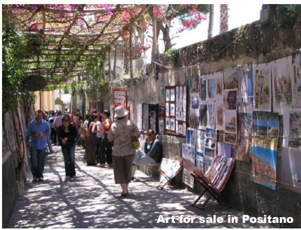
Art for sale in Positano