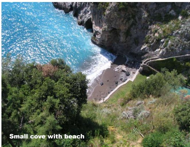
Small cove with beach

Amalfi, 61 km (38 miles) east of Sorrento and with a population of only 5,500, is the largest town on this coast. Dramatically situated at the mouth of a ravine under towering 1,315-meter (4,312-foot) Mt. Cerreto, the burg is sandwiched between tall