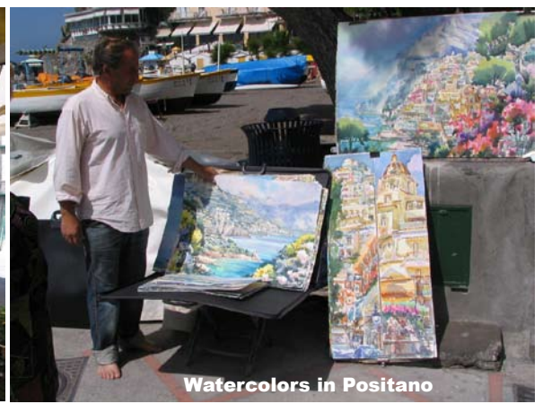
Watercolors in Positano

Europe. Independent from the seventh century until 1075, Amalfi reached the height of its power in about 1000 when it boasted a population of 70,000. Not only was the ship compass introduced to Europe in 1302 by Flavio Gioia, an Amalfi native, but Amalfi's maritime code was used in the Mediterranean until 1570.